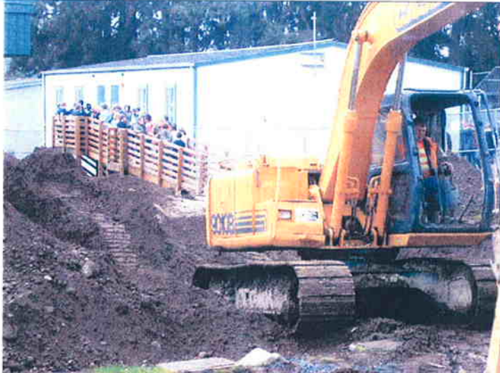
Installation of storm line along west side of building, 4-10-09.