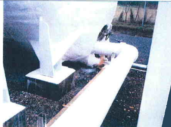
Pipe insulation to fire storage tanks, 4-1-09.