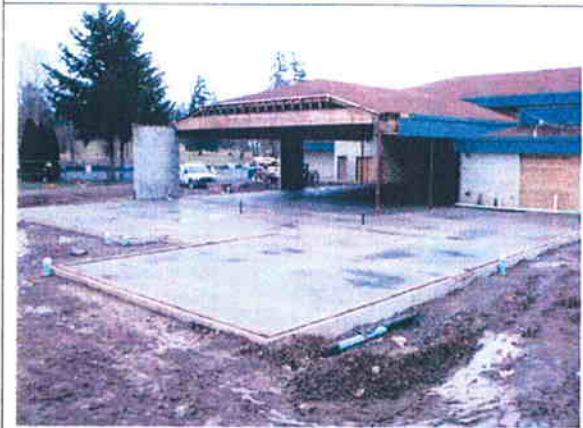
Floor slab for addition, view looking southeast, 3-27-09.