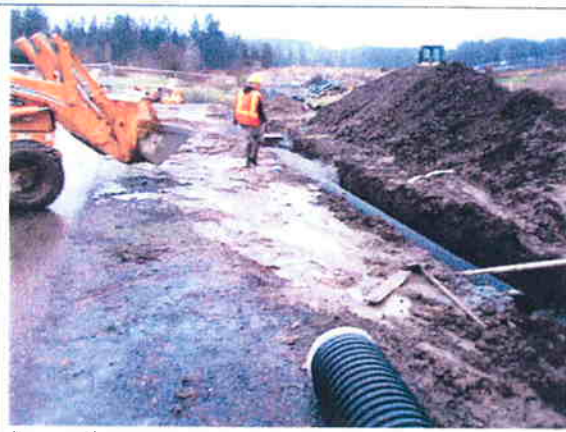
Storm line(new and replacement of existing) along west side of building, 4-1-09.