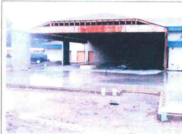
Slab poured for new addition (view looking south), 4-1-09.

PROJECT: Weyerhaeuser Elementary DATE: April 15, 2009