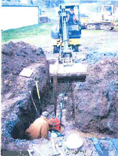
Installation of additional valves on Phase 1 fire loop, 4-08-09.