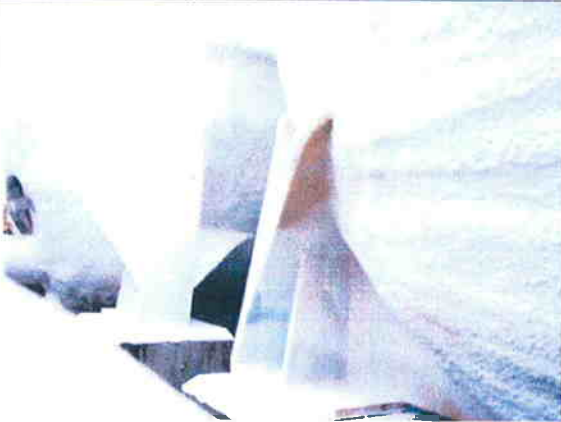
Insulation on fire storage tanks, 4-1-09.