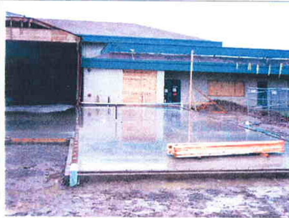
Slab poured for new addition (view looking south) 4-1-09.