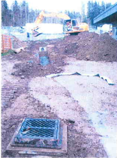
Installation of storm line on west Side of building, 4-10-09.