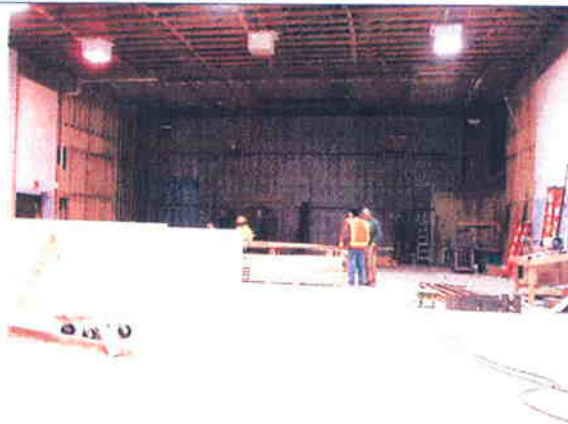
Interior view looking west at multi-purpose room (curtain support beam in foreground left), 3-27-09.