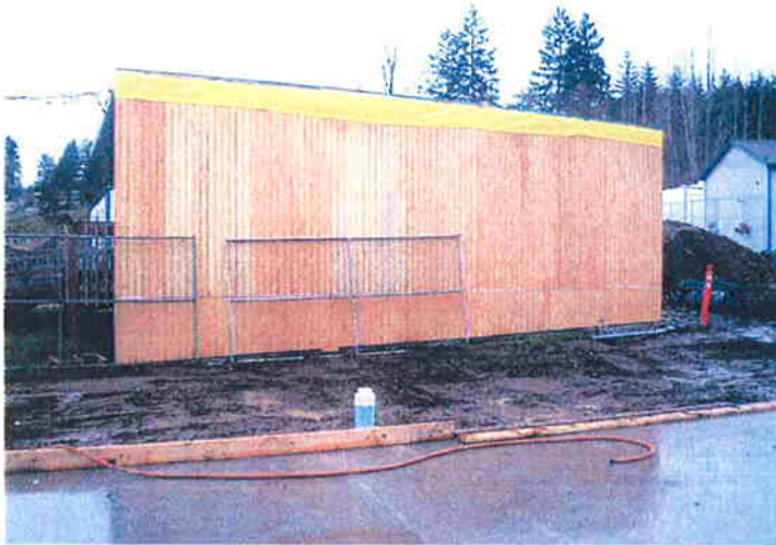
New fire wall on existing portable, 4-10-09.